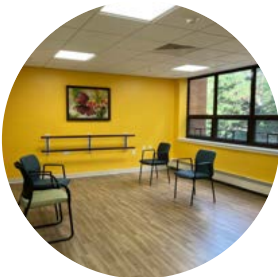
Common areas for gathering, exercise, meditation, and more!