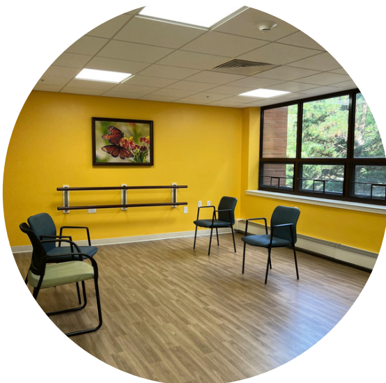
Common areas for gathering, exercise, meditation, and more!