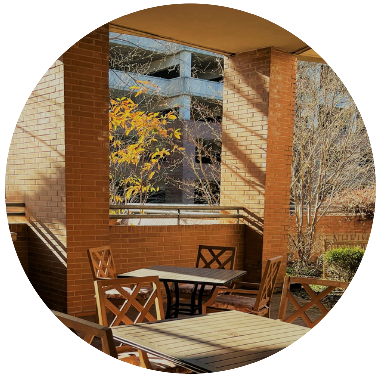
Secure patio with ample seating, spacious outdoor spaces to enjoy the fresh air.